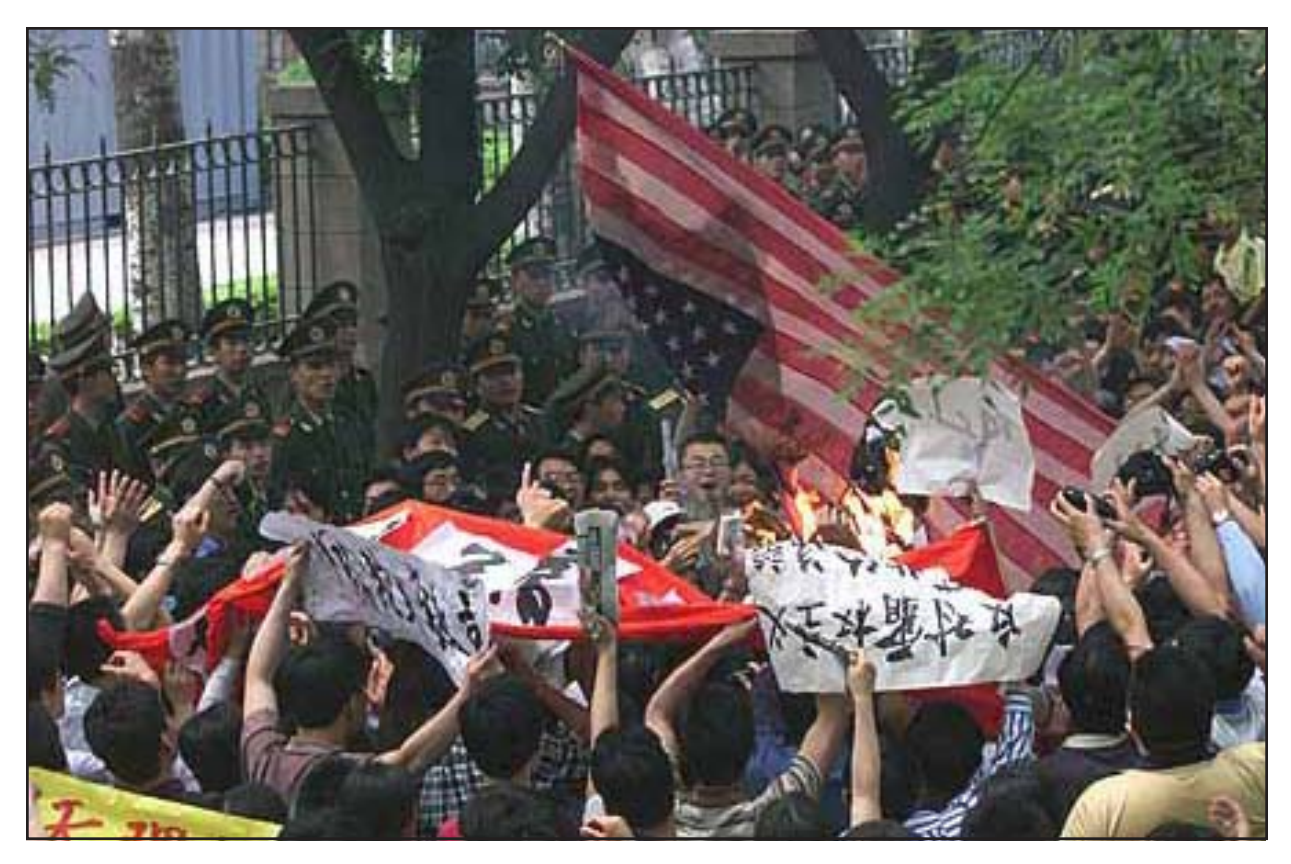
...and we'll be back next month for our visas! Students burn an American flag outside the US Embassy in Beijing during the May 1999 protests over the US bombing of the China's Belgrade embassy.

tour and you don't quite speak the language.