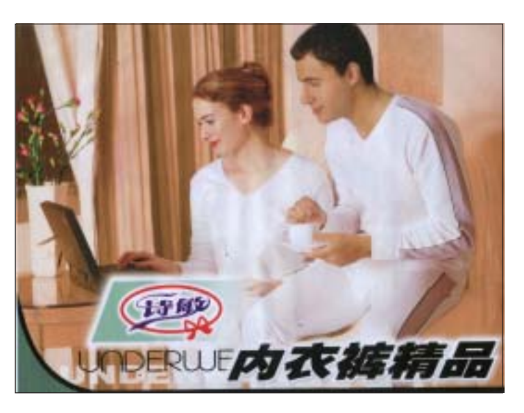
(above) The long underwear expert... The coffee-drinking and laptop usage aren't accidental of course; in Chinese eyes they heighten the foreigner's aura of technological savvy and sophistication. (below) ...and the soy sauce imperialist : Clowning with one of the Chinese kung fu master chefs on a break from filming

This same striving has played out on the macro level for the last 25 years, as a still-largely-rural China has sought to close the gap with the developed nations through the modernization and urbanization of its society and economy. It's no surprise that foreigners are called upon to play the expert in commercials: after we were thrown out of China during the Maoist era, a main purpose of our being welcomed in again was to provide the