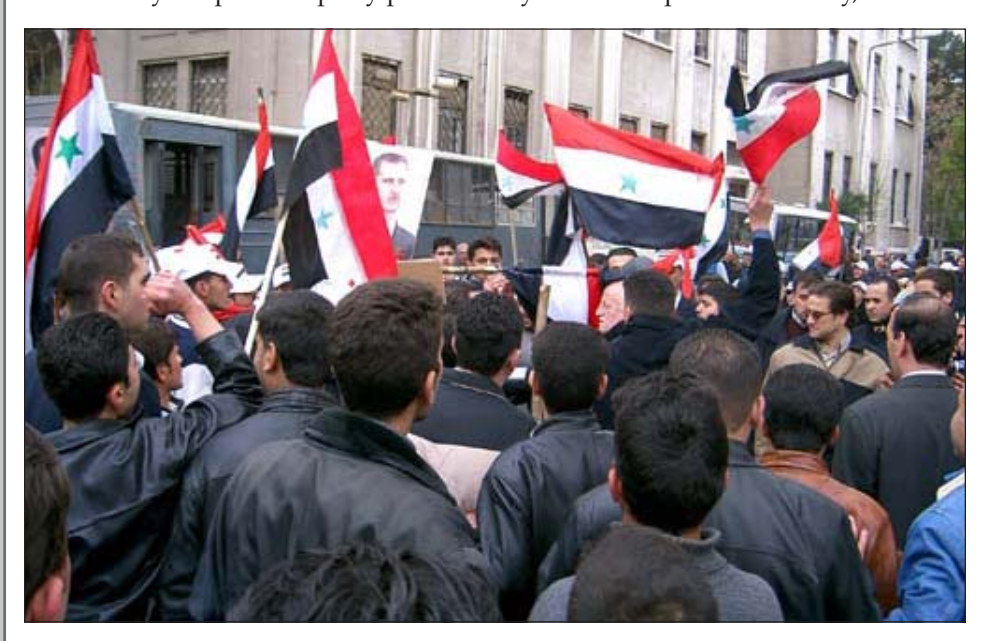
A mob from the Syrian Students' National Union (SSNU) abuse and assault a member of Syria's opposition protesting 43 years of "Emergency Rule" in Syria on March 9.

DAMASCUS, Syria—As I approached the demonstration, I realized that the more things change in Syria, the more the state's reaction stays the same. It was March 9, the 43<sup>rd</sup> anniversary of the declaration of "emergency law" in Syria. For the second year in a row, members of the Syrian Students' National Union (SSNU) were busy beating up and chasing off opposition figures staging a sit-in in front of the old Ministry of Justice — a stone's throw away from the radio station where martial law was declared in 1963 the morning after the Ba'ath Party seized power in a military coup. Multi-party politics in Syria was suspended that day, all in the