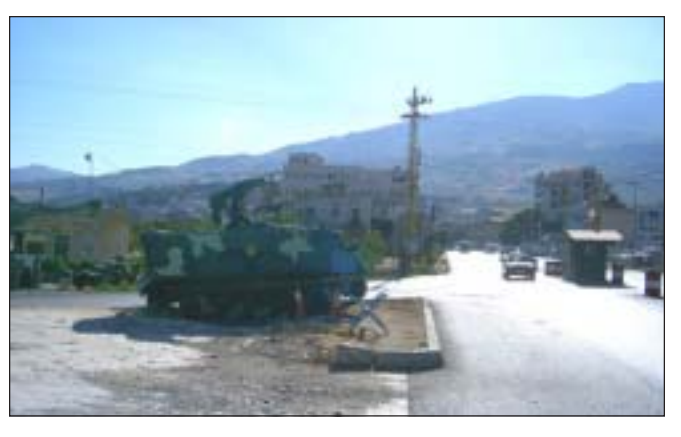
A statue of Basil al Assad at a checkpoint in Chtaura has been replaced by a Lebanese light-armored tank.

While the anti-Syrian bloc — an alliance of Hariri supporters, Walid Jumblatt's Druze Popular Socialist Party, and Samir Geagea's right-wing Christian-based Lebanese Forces — won the election, forming a government proved hard going. Saad Hariri, Rafik's son, was dubbed too inexperienced to navigate Lebanese politics just yet. Instead, the Hariri family looked to Fouad Siniora as the best man for the job. Problem was, Lebanon's multi-confessional system requires extensive negotiations over