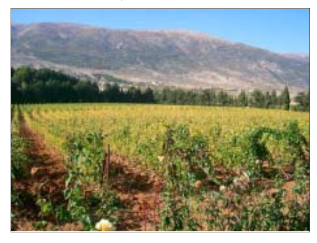
A vineyard adjacent one of Lebanon's premier wine chateaux. While many might not know it, the Bekaa Valley is the heart of Lebanon's wine industry.

tumultuous period during the Lebanese Civil War, which saw bloody battles between Syrian and Israeli forces that made the Bekaa internationally famous, the valley seemed to revert back to its old self — a sort of paradise of vineyards, wine chateaux, Roman ruins and stunning views that could easily double as the Garden of Eden.