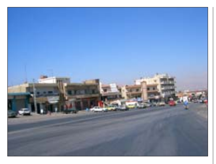
The taxi station and markets at Masnaa, near the Syrian frontier. Business there has been decimated by political tensions between Damascus and Beirut.

off, looking for gifts, en route to Syria.