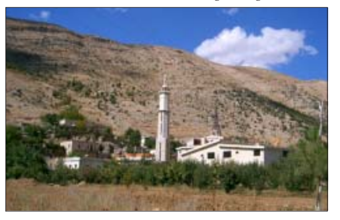
The orchards and minarets in Yamouneh, interlaced with Hizbollah flags and hashish plants.

Hungry, we stopped at what appeared to be a restaurant below the wall, with a stream running through it. An old