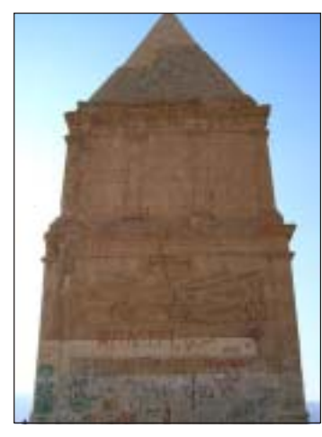
The "Pyramid of Hermel" a somewhat eerie monument of unknown origin on a hilltop overlooking the top of the Bekaa Valley.

I shouldn't have even asked. No one was talking, especially to foreigners. Everywhere in Hermel people could be seen strolling along roads or sitting in front of shops. Not much