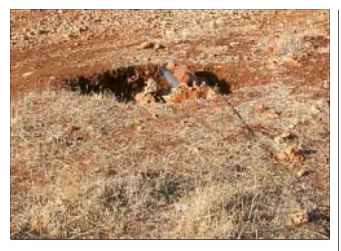
A hurried snapshot of an Improvised Explosive Device, freshly planted outside the Popular Front for the Liberation of Palestine — General Command (PFLP-GC) camp in Sultan Yacoub, after the Lebanese Army surrounded Palestinian militias in the Bekaa in October.

tumultuous period during the Lebanese Civil War, which saw bloody battles between Syrian and Israeli forces that made the Bekaa internationally famous, the valley seemed to revert back to its old self — a sort of paradise of vineyards, wine chateaux, Roman ruins and stunning views that could easily double as the Garden of Eden.