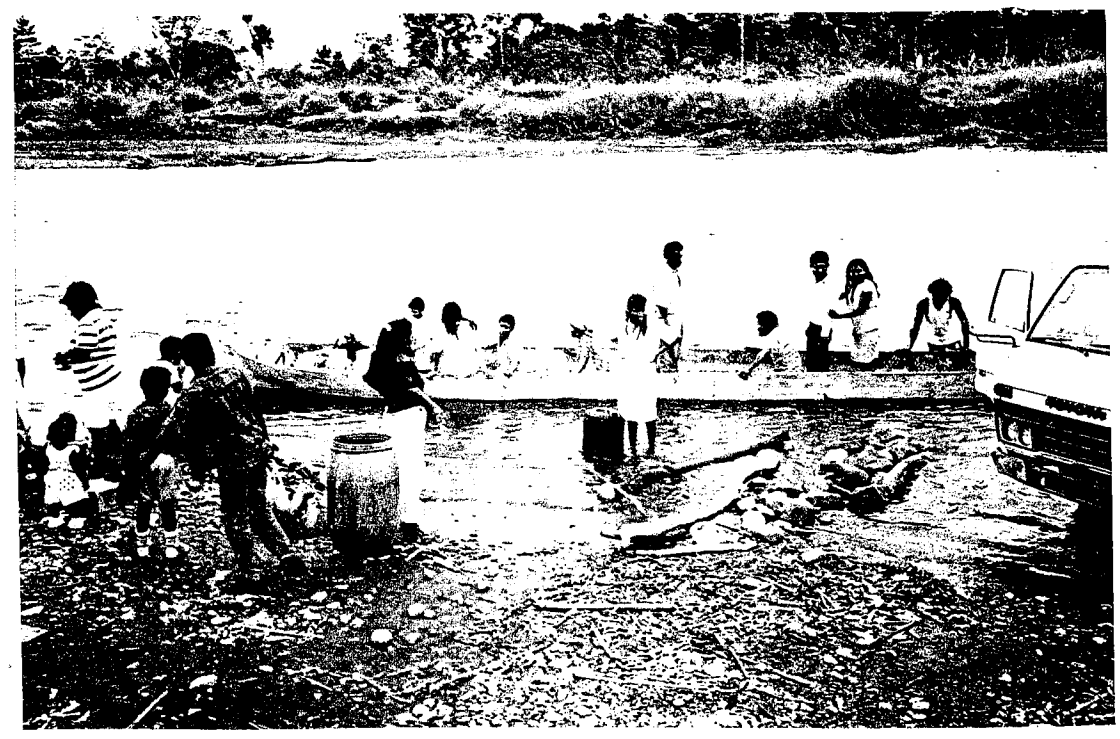
Crossing the river Telire

Another health post in the Talamanca Indian reservation is located at Amubri, a settlement on the other side of river Telire. To reach it from Shiroles one has to come to Suretka and cross the river by boat (no bridge built yet). Then take a minibus from the riverside to Amubri which is a 20 minutes drive away. Many Indian homes (with thatched roofs) can be seen on the way.