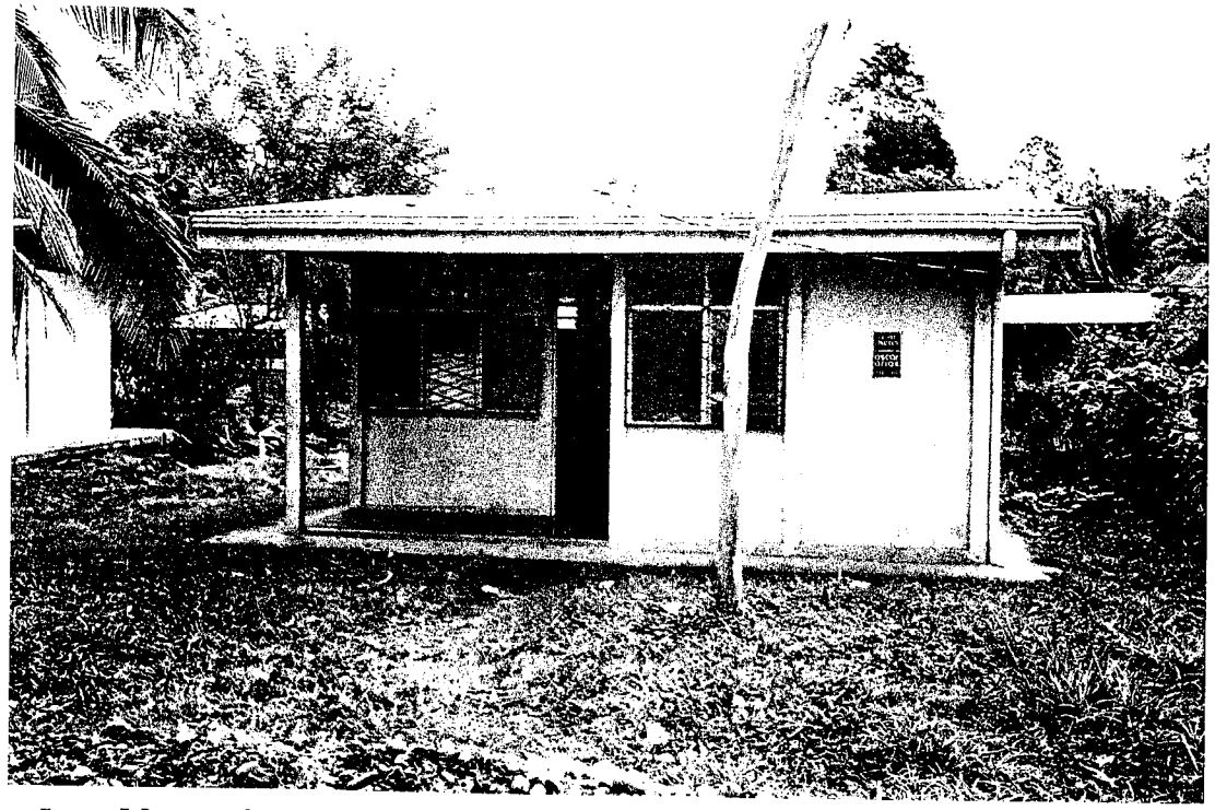
A well-equipped health post in Shiroles sits abandoned without medical personnel.

Mojoncito. The nearest puesto de salud (health post) is in Shiroles, a small town down the mountain to the east. It takes about three hours of walking through forested mountains and crossing of a river before arriving finally to Shiroles. However, when he arrived to Shiroles the health post was closed. Neighbors told him that there has not been a doctor for two years. The best he could do then was to proceed to Bribri where there is an integrated health clinic run by both the Ministry of Health and the Social Security (CAJA). He was lucky to find a place on a lorry which gave him a lift to Bribri, though the ride itself was quiet rough and uncomfortable (and his arm hurt him) on the bumpy 18 kms dirt road. The public bus available commutes only twice daily between Bribri and Shiroles.