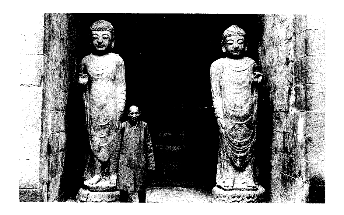
Head Monk at the Temple of the Thousand Buddhas on the October Commune near Nanking

journal, The Modern Buddhist, on his desk. He also showed me the Monastery's collection of books. There were more than 7,000, some in Tibetan, and others in Han script. One of the books had come from Ceylon more than 500 years ago.