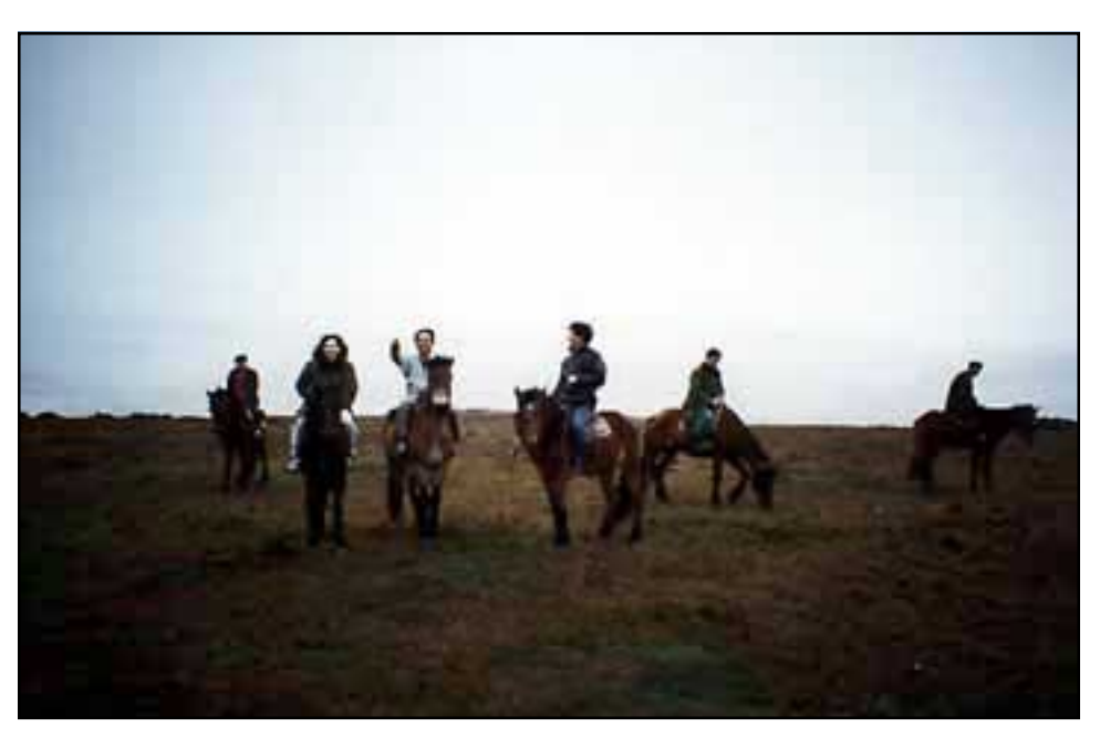
Riding "Japanese thoroughbreds

Rather than calling it the Longli County Grasslands, we thought the traditional name given by the Miao villagers added a nice touch."