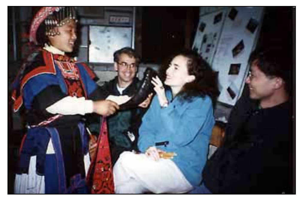
Villagers from the area [Miao national minority] provide nightly entertainment for the visitors in a show of local customs, including singing and dancing.

the mountains. The Guizhou All-City newspaper article quotes a woman after she returned from the grasslands, where she rode a horse for the first time: "I came back and told a friend that I had found the sensation of being perched out over the bow of the Titanic as it sliced through the vast ocean ahead, just like the movie."