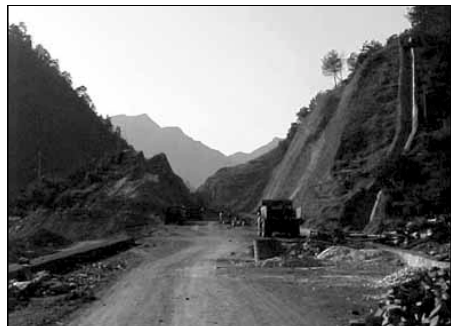
"If you build it, ... they will come." Though infrastructure improvements such as the construction of this section of an expressway that will shorten the trip from Guiyang to Duyun by half the time, are critical to the development of Guizhou's economy, tourism is not simply a matter of building roads.

understand the interests of the tourists."