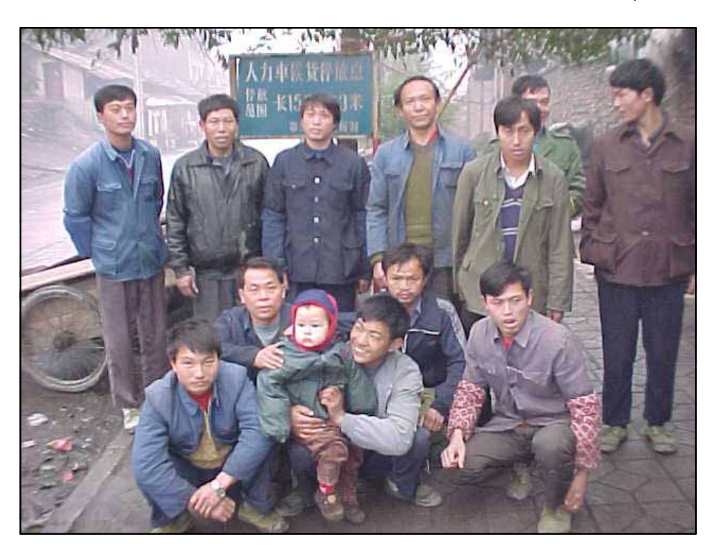
Modern-day coolies. The men preferred to stand rather than have their picture taken around the fire.