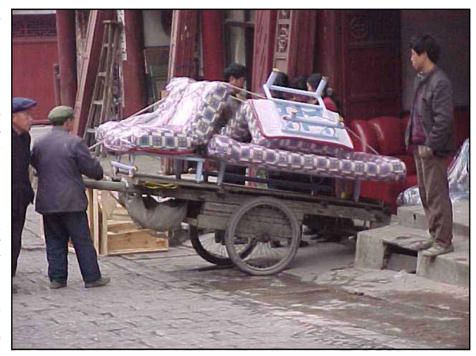
If it can fit on an eight-by-three-foot flat space they'll haul it. A porter finishes up tying down a set of furniture.

After expenses, which are minimal [30 yuan for rent and 100 yuan for food], each porter clears between 300 and 500 yuan a month. Compared to the cash available at home, this is a significant amount.