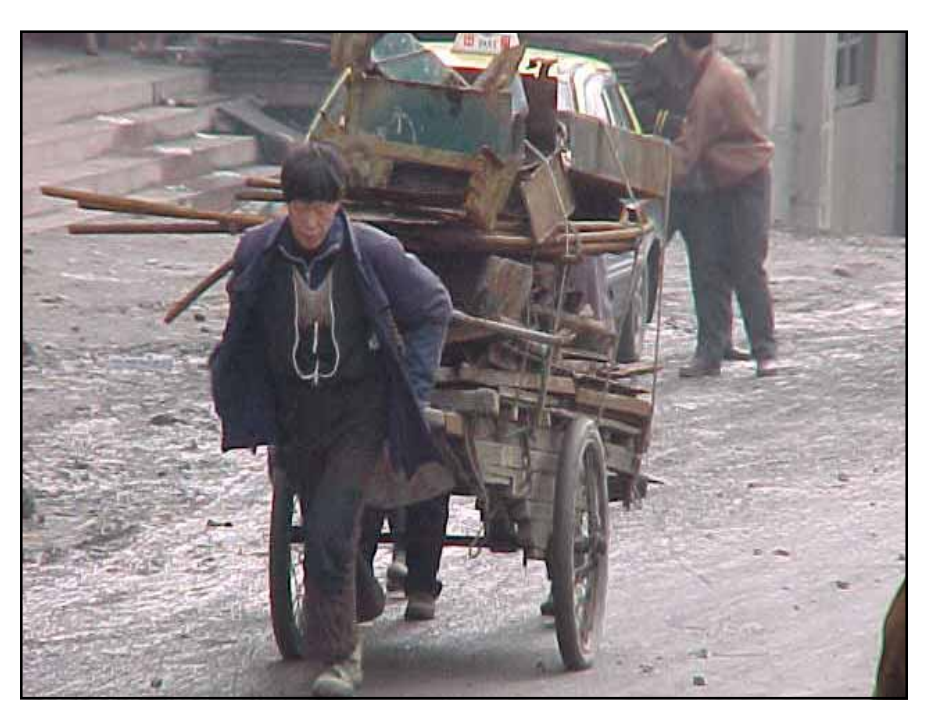
One of the loads of scrap metal. Even the slightest gradation required extra strength from behind. Going over a bridge, we backed up traffic until all three pushcarts crawled across.

Subcultures, whether Washington, D.C.'s homeless population or Beijing's princelings,<sup>6</sup> have their distinct mores, vocabularies and common experiences. In this way, I was struck by the sense of community experienced