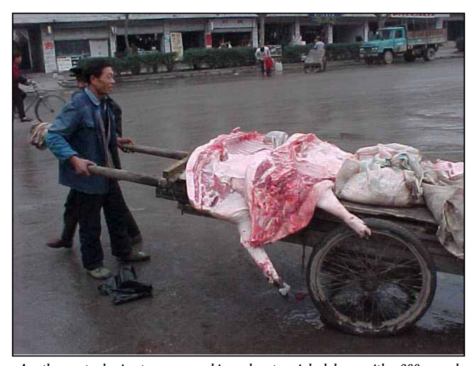
Another porter begins to maneuver his pushcart, weighed down with a 300-pound hog that has been split right down the middle.