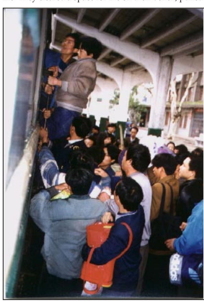
At one stop in Hunan province my companions opened the window just long enough for me to take this picture of people trying to push their way into the train's doorway. As soon as those in the back of this crowd saw our opened window, they rushed toward us. We were able to close it just before the crowd closed in.

As I came into view the boys seemed delighted to see me. They cleared a space for me on their bench, pulled