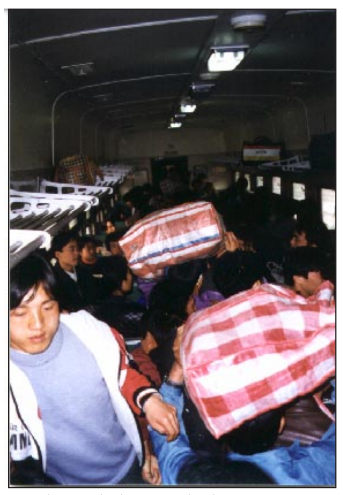
Pandemonium breaks out as people stake out space on our car.

the door with the others. There in the dimly lit, bar-like atmosphere stood at least 100 people crowded toward a door on the other side of the room that would eventually open onto the station's platform-side of the building.