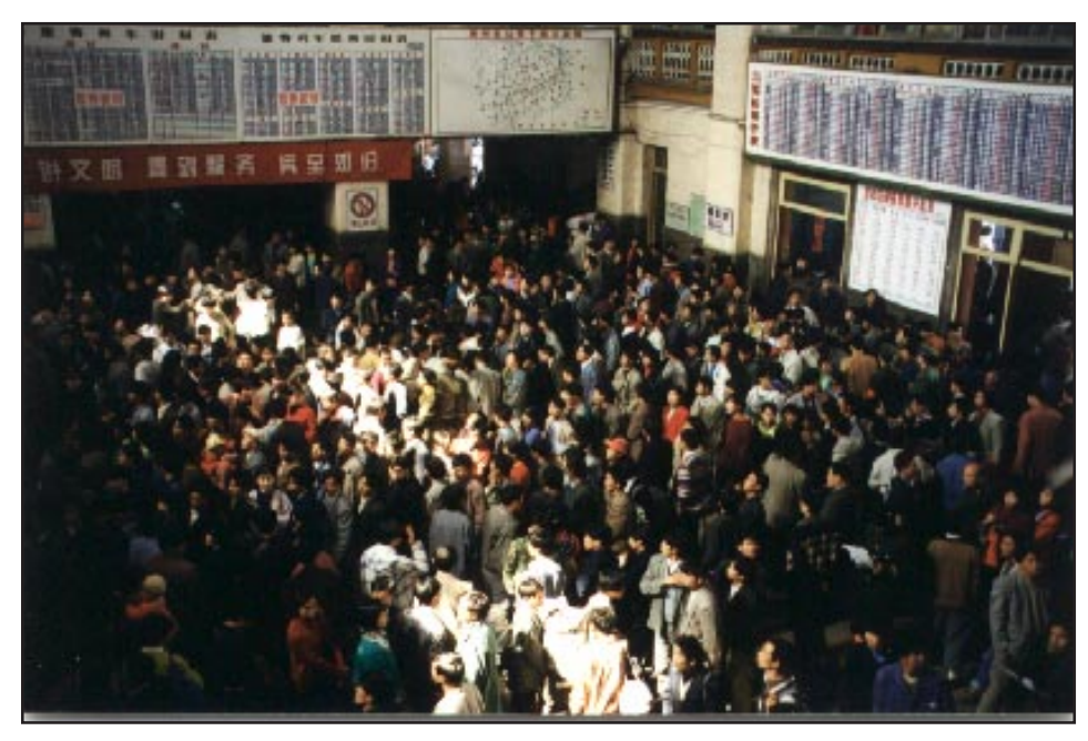
On the first day after the Chinese Spring Festival, the Guiyang train station was packed with people trying to purchase tickets to travel back to China's coast.

As I stood outside the Duyun train station, enjoying what would probably be the last breaths of fresh air I would have for two days, I noticed a steady but quiet stream of people, baggage in-hand, filing into the narrow door of the train station's tea room. Naturally curious, I walked over to see what was happening. "Two yuan for a head-start on the rest of the masses," a train attendant announced at the door. I dished out two yuan and slipped in