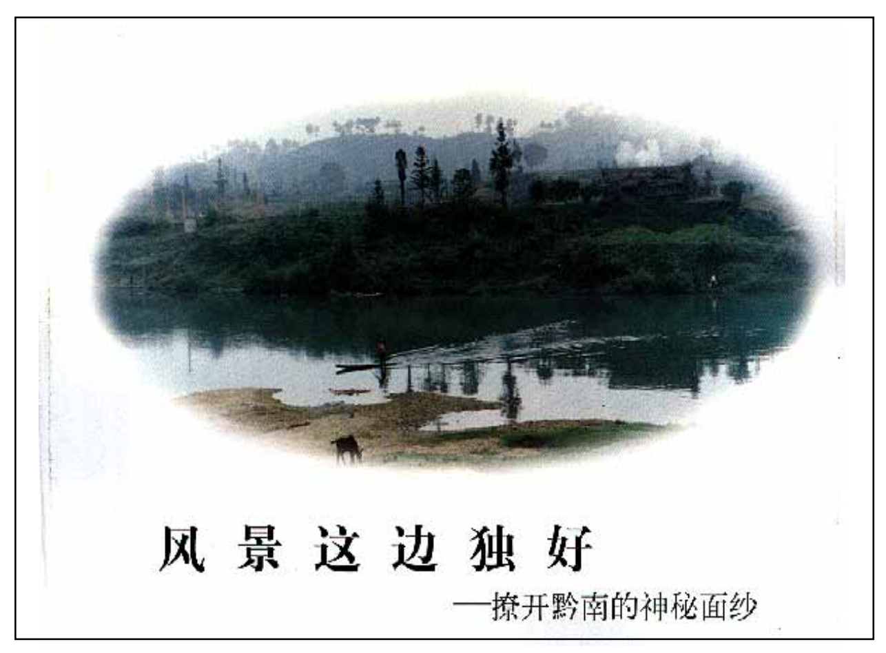
Shenzhen Cigarette Factory donated U.S.$60,000 to design and print postcards that showcase Qiannan's stunning mountain scenery and colorful ethnic minorities. The pack's cover reads: "The Scenery Over Here is Unique — Remove Qiannan's Mysterious Veil." The postcards hope to draw tourists, and their pocketbooks, to what is otherwise a poor, backward region.