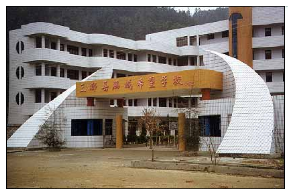
Shenzhen Hope School, with its four-million-yuan investment, belies its location — the remote, impoverished mountains of southern Guizhou Province. It is the largest of 21 Shenzhen-supported schools in Sandu County.

Of these and other recent initiatives, the most fascinating policy I have observed is a central-government initiative to create sister-city relationships under which wealthy coastal cities adopt their poor, inland cousins.