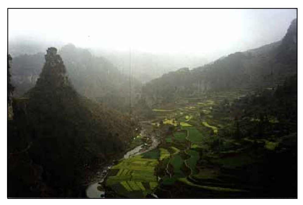
Guizhou's mountain scenery hasn't changed for thousands of years.