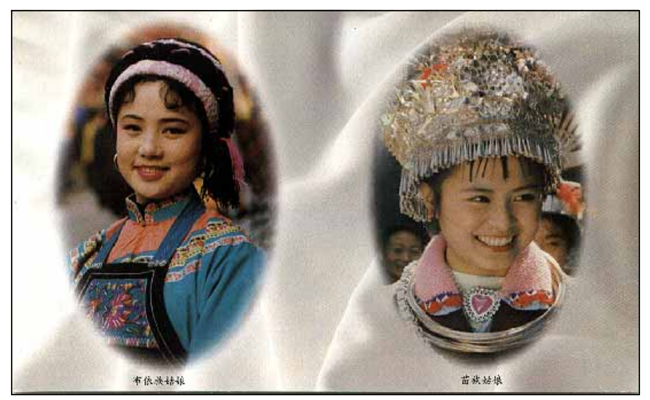
Postcards like this one — picturing a Buyi ethnic minority bride (l) and a Miao ethnic minority bride (r) — hope to attract travelers to discover one of Qiannan prefecture's greatest resources: its people.