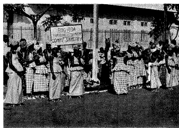
STREET SCENES DURING HOUPHOUET'S VISIT TO CONAKRY