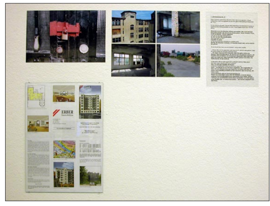
Laura Horelli , media spree, 2004-ongoing, details from an installation comprised of photographs, brochures, texts, table and chairs.