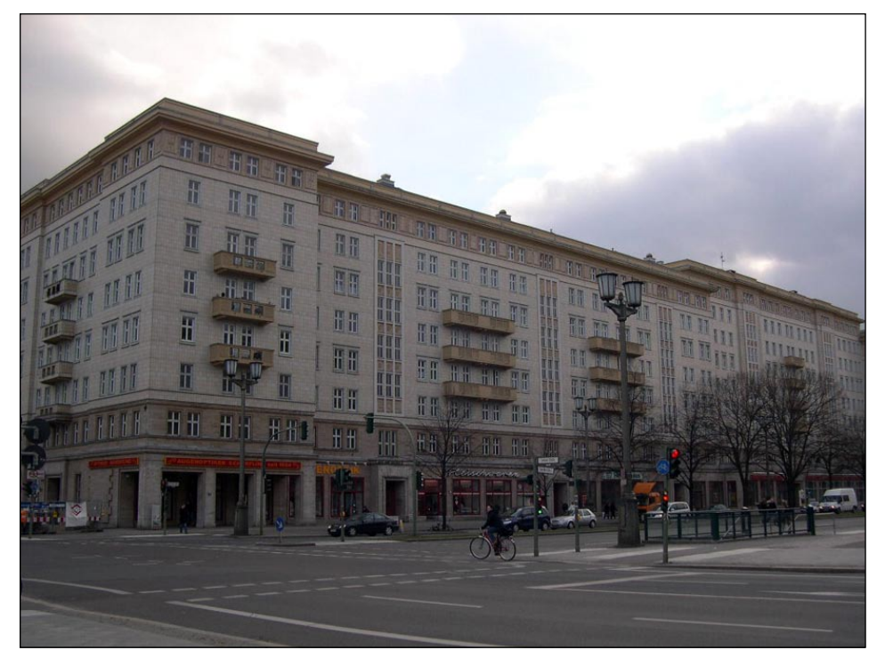
(Above) One of the "Stalinist neoclassical" apartment blocks on Karl-Marx-Allee. (Below) The impressive and imposing view down Karl-Marx-Allee looking towards Mitte, with the famous Berlin TV tower visible at the end of the boulevard.