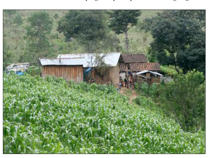
An isolated family home in the department of Totonicapan.

One of the programs put in place after the signing of the