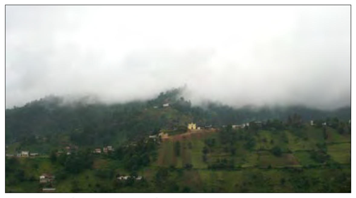
Hillside farms in the department of Totonicapan in Guatemala's Western Highlands.

It defies reason: they are mainly subsistence farmers, feeding themselves with the food they grow. A spike in prices at the market should not matter. And their energy use would make Al Gore blush. Electricity service only came to the