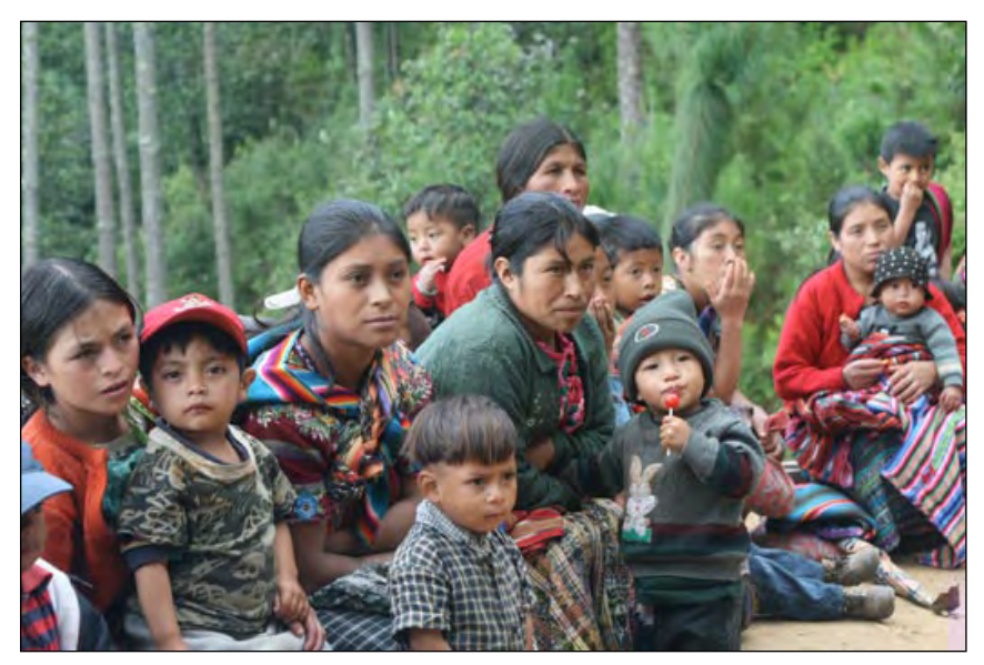
A group of Mayan Quiche wait for a free health checkup. The boy pictured in front was found to be 10 pounds underweight and referred to the hospital.

likelihood that a little girl can overcome circumstances — including a lack of access to education, lack of running water and sewage, her mother's race and her father's salary — to move up the socioeconomic ladder. The researchers found that Guatemalan children living in circumstances often found in the countryside — with four siblings and a daily per capita income of $1 — are less than 25 percent likely to complete sixth grade, have a 20 percent chance of having proper sanitation, and have a 60 percent chance of having running water. The factors add up to make rural Guatemala one of the most difficult environments for poor children. The report draws the picture of a poor Guatemalan girl living in the countryside with four siblings and parents that earn roughly $180 month as subsistence farmers — a situation similar to Victor's 3-year-old daughter Elena. "What are ... the chances [she becomes] a prominent lawyer or a university professor? Not very high, and certainly a lot lower than those of a 6-year-old boy growing up in Guatemala City with two parents in his home, both with a secondary education and a good income, and only one sibling."