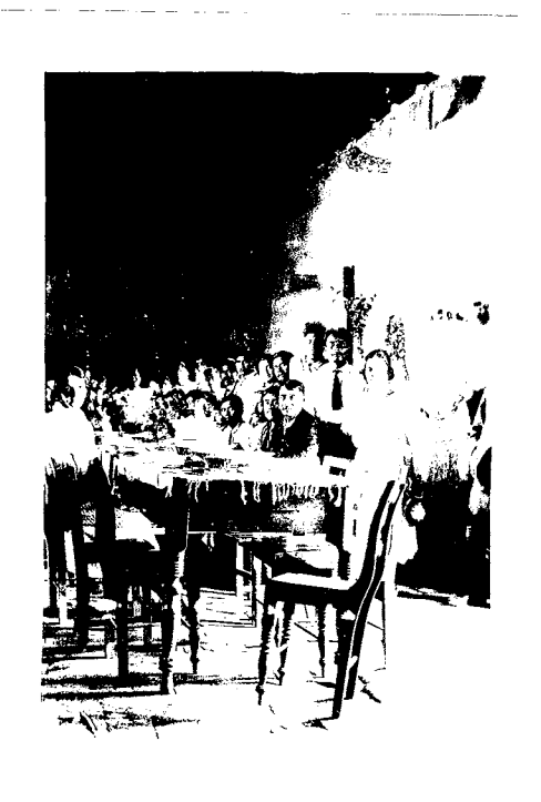
Rural School Teachers at a Cultural Mission - Yauhnitan, axaca.