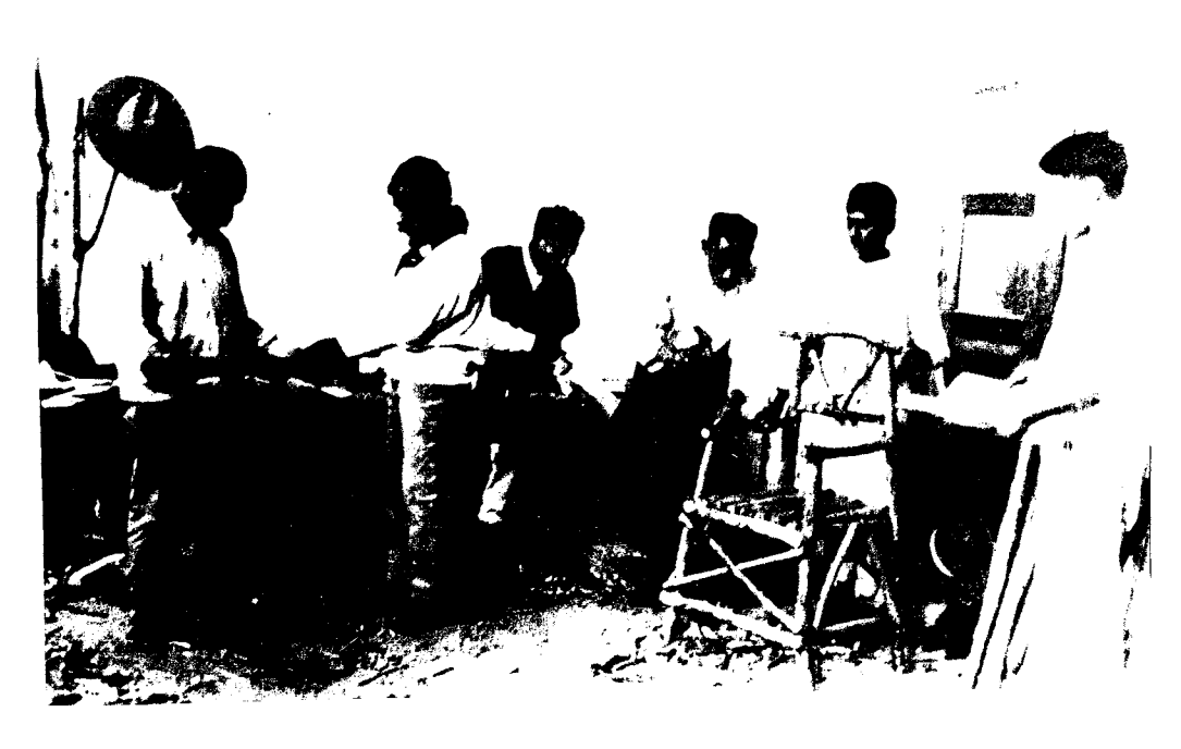
A Class in Carpentería"- Cultural Mission, Yulalag, Oaxaca.