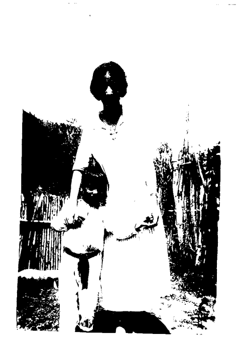
Mission - Etla, Oaxaca.