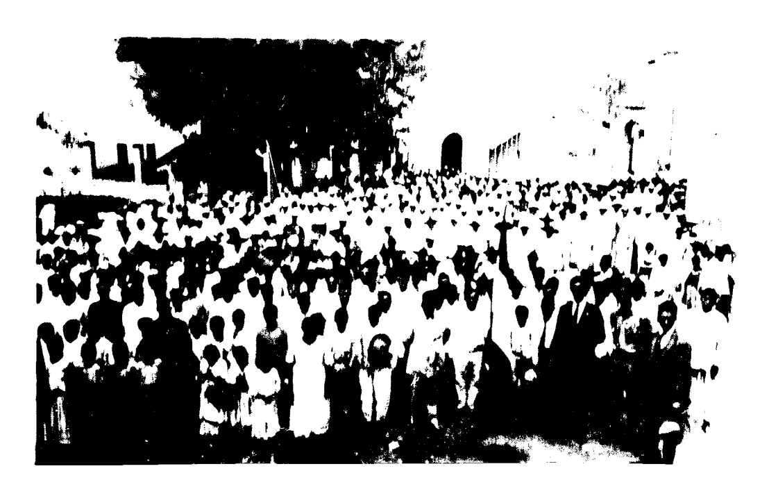
Villago Bathered to Recieve a Cultural Mission - Yulalag, Oakaca.