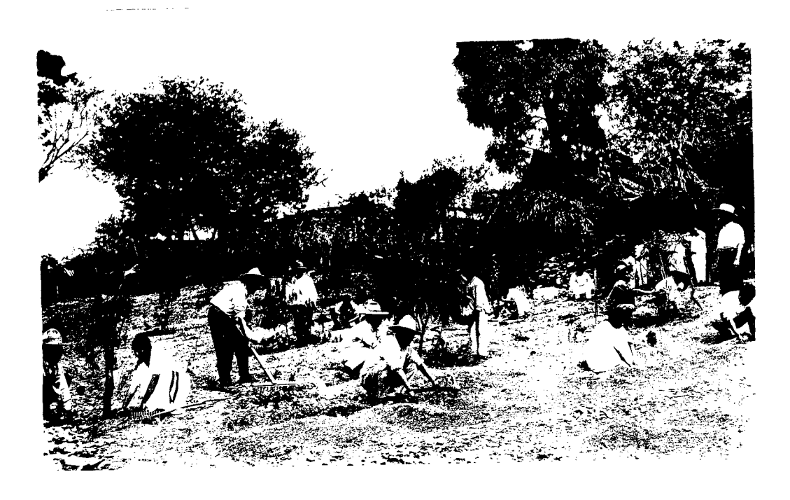
A. Class in "A gricultura" - Caltural Mission - Yulalag , Daxara.