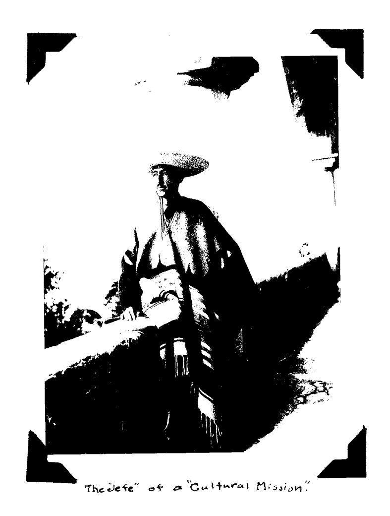
To jointal Villagowhere Cultural Missions are Held-Actopan.