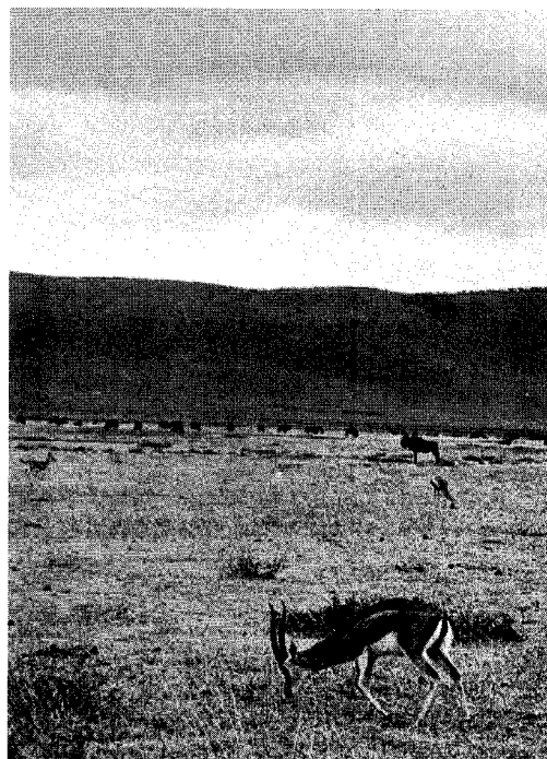
This Thompson's Gazelle has tender and succulent meat.

In order to carry out successfully the plans suggested at the conference, three things are needed: further research, trained personnel and money. The need for research is obvious. Unless governments have the results of research in a wide variety of fields, they will not have the information necessary to implement policies such as game cropping. These policies must be based upon precise factual detail or much harm can be done.