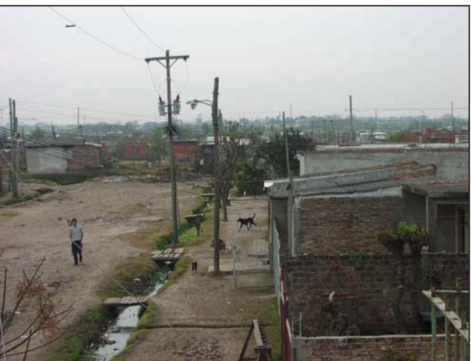
The far end of the neighborhood of El Tala, San Francisco Solano. El Tala's neighborhood association was the only one of the five to survive the return to civilian democracy in 1983.

During our first meeting, six members of the CTA-Solano and I sat on uncomfortable plastic chairs around a rickety wooden table in a cold, unheated cement room. Their organizing history goes back 20 years to 1981, well before the creation of the FTV and CTA in the 1990s. In just one