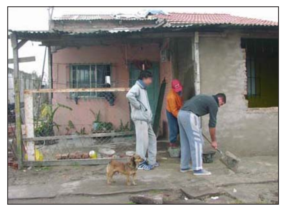
These men receive Planes Trabajar through the CTA-Solano and are contributing their labor for repairs and improvements to this home.

ment I was eminently aware that discussing gender dynamics in a mixed-gender group had limitations, but could be revealing as well.