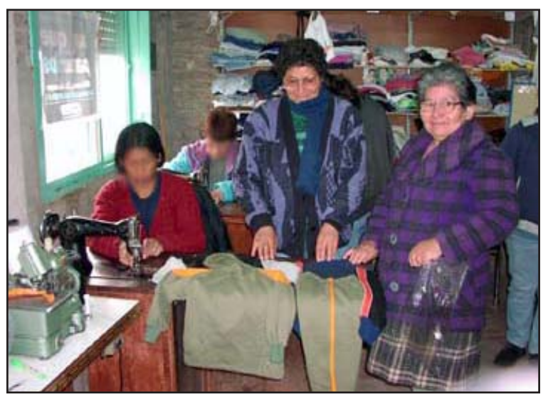
Members of the CTA-Solano's sewing cooperative

During our first meeting, when I turned the conversation toward gender dynamics within the organization, the women simply smiled while the men giggled and squirmed in their chairs. One man made a joke about how lucky he was to be seated close to the door. In that mo-