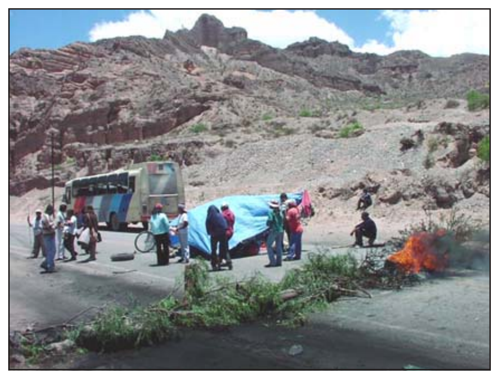
A piquete just outside Tilcara in the Argentine northwest.

Early Friday morning, I took the subway to the Retiro train station and caught