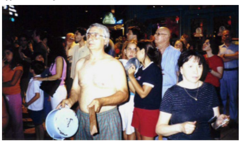
Men and women of all ages banged pots and pans in the streets of Palermo and other neighborhoods in Buenos Aires to protest the government's economic policies, including a $250 weekly cash limit on withdrawals.

Tonight at 8:30, I was giving Camilo a bath when I began to hear clanging pots and pans. Anticipating tomorrow's general strike, men and women across Buenos Aires banged cooking pots and drivers tooted their horns to express their opposition to the government's latest economic measures. The sound was so deaf-