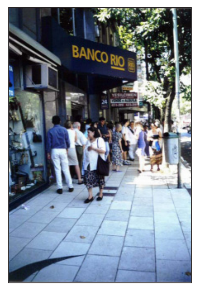
All over the city, the lines at banks to open accounts, sign up for a debit-card or simply request information wound around the block.

The riotous clanging lasted twice the 15 minutes programmed. I had read about such a protest last year in a US magazine, but it's something else to watch your neighbors striking the hell out of their sauce pans and the guy who sells us our newspapers banging the lamppost with all his might. From what I'm hearing on tonight's news,