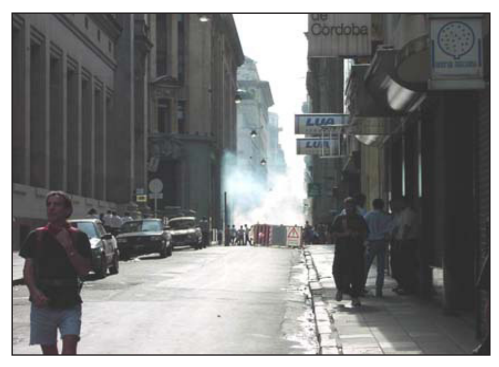
Smoke and tear gas filled the streets around the Plaza de Mayo during days of looting and protest by hungry and furious Argentines.

Then at the deli-counter I waited with a slim woman