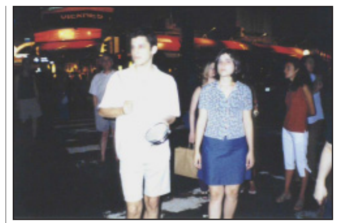
On December 28, people mobilized in another spontaneous cacerolazo which led to the resignation of the new President's chief adviser, who is charged with corruption.

Meanwhile, tension has also been heightened by continued, if sporadic, violence. Yesterday, train workers who have not been paid for months attacked railroad offices at the Once station and burned the train cars they normally work on. Also yesterday, three young men watching TV in a market in the neighborhood of Floresta commented something to the effect of "he deserved it" when images of young protesters at-