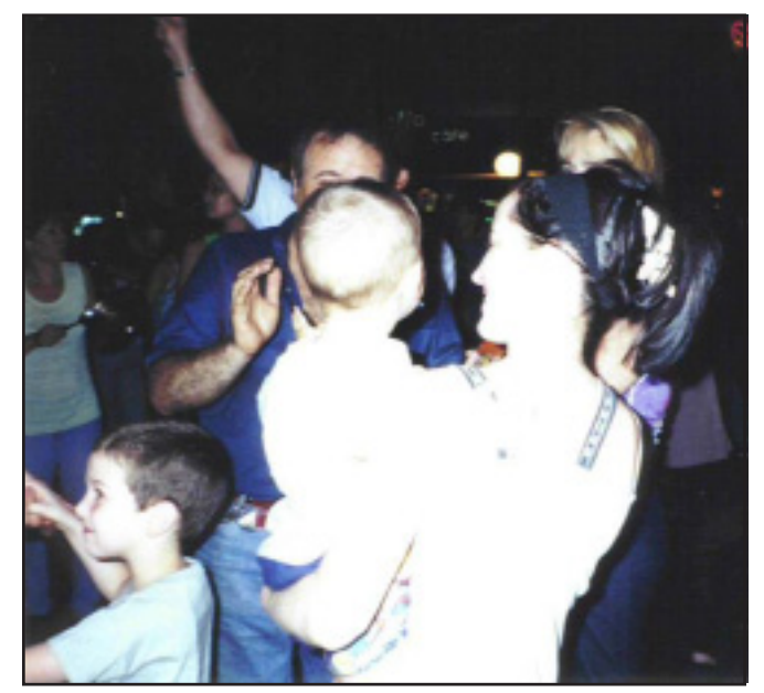
Many parents with small children participated in the latenight cacerolazos and marches.

Today saw widespread looting throughout the country, including sections of downtown Buenos Aires and its suburbs. It was horrific to watch Argentines pitted against Argentines, all of whom blame the government not each other—for the current crisis. Traumatized shop owners were filmed in tears. Looters were filmed screaming, "We're hungry!" and "We want to work!" Municipal workers on strike in the city of Córdoba stoned and burned the municipal headquarters. Sixteen people have died, some killed by shopkeepers. I've been worried about Camilo's teacher Marina, whom I love dearly. She