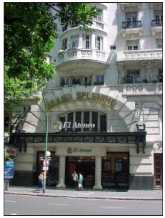
Each of the photos in this newsletter was taken at the Ateneo Gran Splendid bookstore-café on Avenida Santa Fe at Riobamba.

We walked all the way to the back, to what used to be the