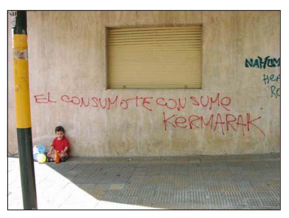
"El consumo te consume," or "Consumption consumes you." Sex is something Argentines consume. Even visions of themselves are something they consume.

I have a soft spot for these teens. They exposed their conflicting feelings about their changing bodies. They adhered like super-glue to traditional, scripted gender roles, though several shouted out or murmured their frustration with gender stereotypes. The boys panicked about pregnancy, the girls pontificated about abortion, and they