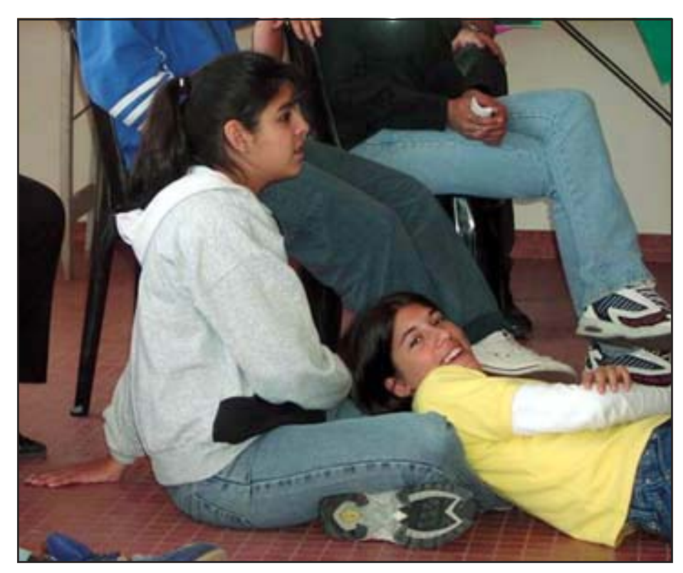
So, are they really having all that sex? For this group, the answer is, "not really."

this group, the answer is, "not really." Of the total surveyed, eleven have lost their virginity and eight haven't. Currently, only one quarter are sexually active and three quarters are not. Assuming their answers are truthful, their first experiences were mostly positive. Both boys and girls feel free to initiate sex, which bodes well for the sharing of power and responsibility, and they seem to use a lot of condoms. But there have been troubled times, too—things like having sex in order to keep your boyfriend, or having a first experience you later rate "Bad."