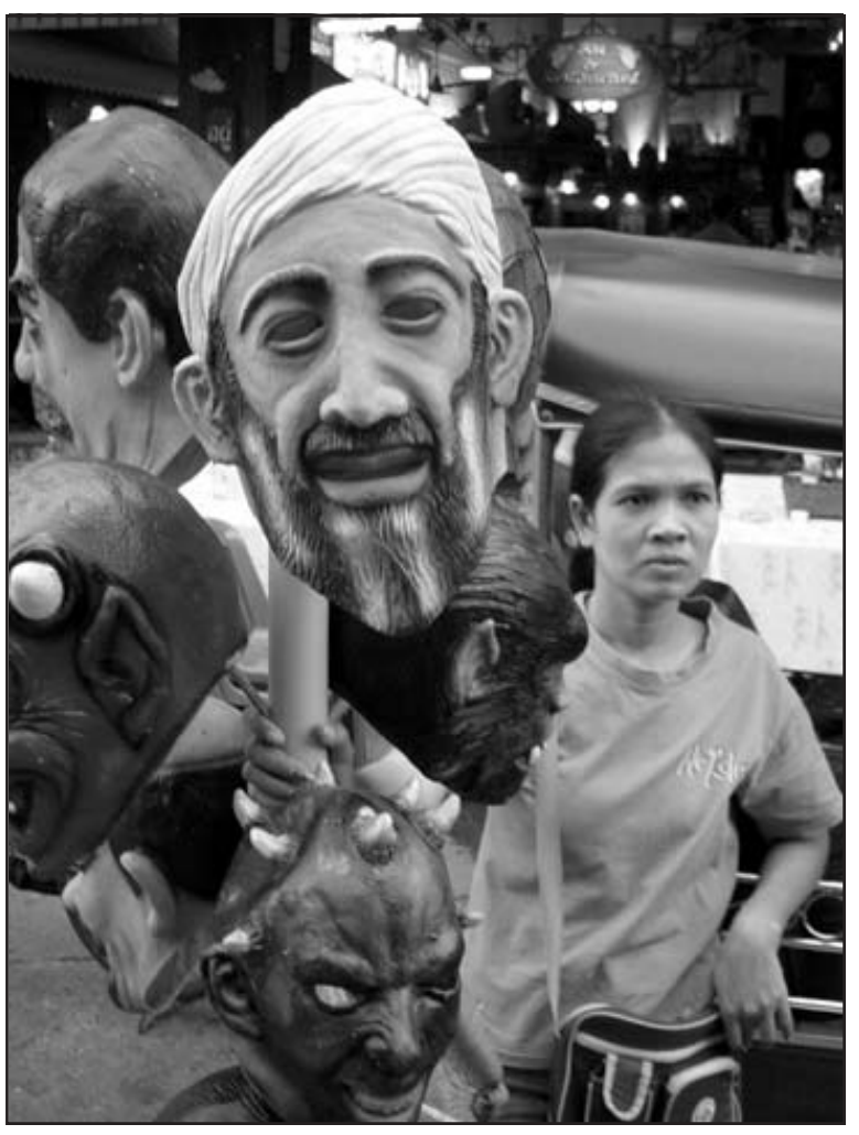
Hot item: Bin Laden mask for sale, Khao San Road, Bangkok

stepped up after Bali, but the workers are not universally happy about it. In practice, enhanced security just means more police arriving at 2 AM to enforce the legal closing time. Otherwise, the police keep a low profile. "Farang don't want to see police when they're out at the bars," says one woman.