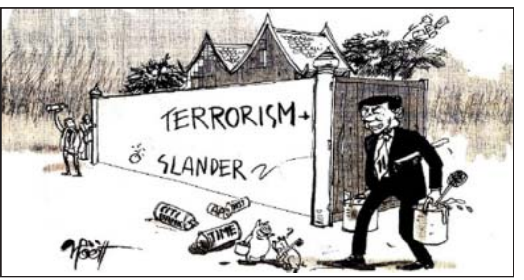
Whitewash: Thaksin counters reports of a terrorist threat. The Bangkok Post, Nov. 23, 2002

lence? Is it motivated by profit? The observer is reduced to imputing motives for actions about which almost nothing is known except the general context and the results. The distinction between a common murder and a terrorist act hinges on what the gunmen (or their paymasters) intend to accomplish. Are they striking a blow against Siamese oppression or just getting paid?