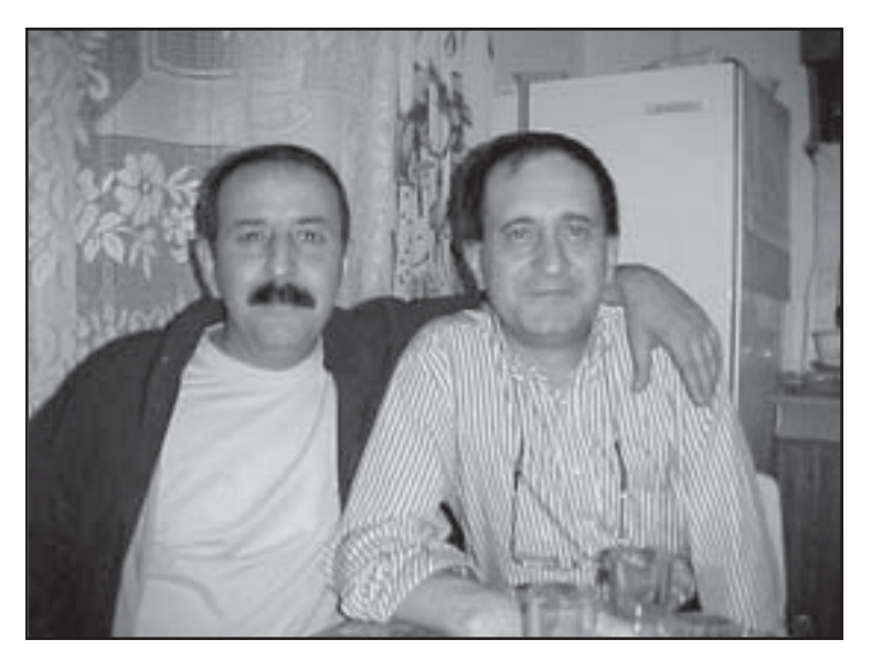
Ziya and Kutsi refer to each other as "bacanak," or brother-in-law.

As we walk around watching these moments of destiny quietly being transacted between the species, it strikes me that wielding the power of life and death represents a rare role-reversal for most of the humans involved. Newspaper headlines these days are dominated by the debate over whether the constitution should be amended to allow 75-year-old Suleyman Demirel, aka "Baba," another five-year term as president. In Turkey, it is a law of nature that party bosses die in harness. The only power in the land that can rein them in is the army, as it does every ten years or so. For ordinary Turks, like those walking around the market, the struggle for power is a battle among titans that they can no more affect than the mortals of Athens could interfere in the squabbles on Olympus. Could it be, I wonder, that for Turks killing sheep is a projection of the harsh paternalism they have always suffered in their still-feudal society? Beyond the Muslim world, animal sacrifice is important in Orthodox Christian countries and, in the form of the bullfight,