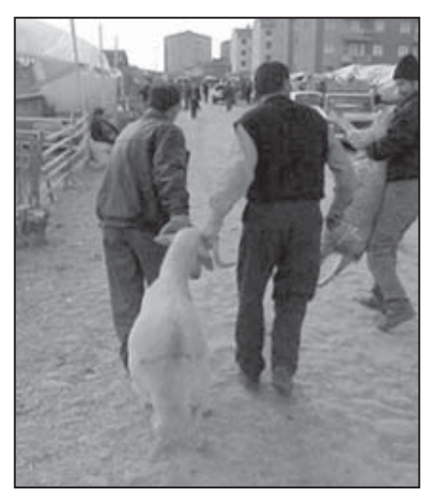
The sheep offer feeble resistance after they're chosen for sacrifice.