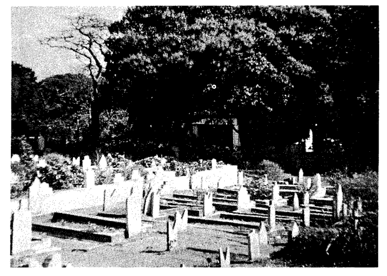
Community cemetary and Mosque

It is true that the municipal authorities have not provided them with facilities for an indoor water supply. Outside taps are spaced through the settlement, as are toilets and latrines. These seemed to be as clean as possible under the circumstances. The leader of the community said they are very strict about prohibiting outsiders who might spoil the group's law-abiding reputation. They have had to call the police to eject those making and drinking beer in their territory. As Moslems they do not drink.