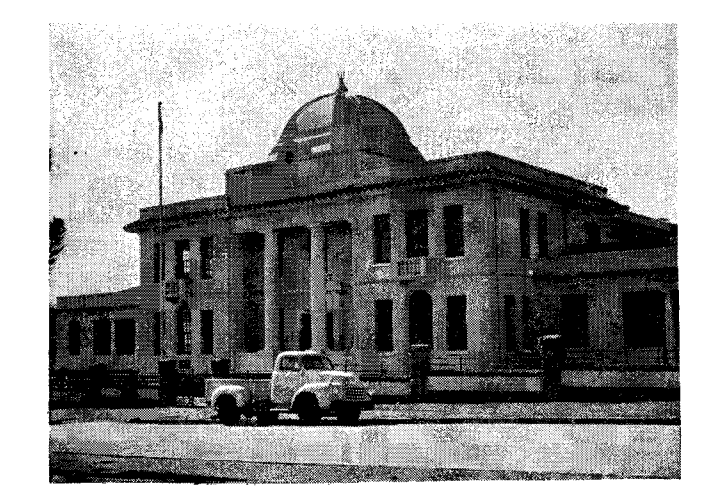
The Bunga Building - Bantu Parliament of the Transkei at Umtata