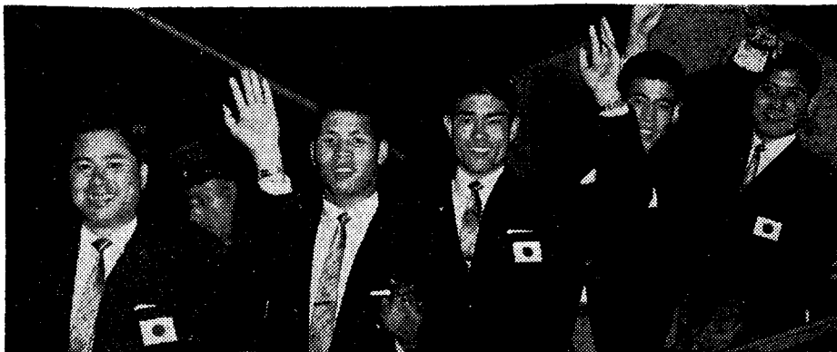
The visiting swimming team arriving at the Cape Town airport

A few weeks ago the Management Committee of the Pretoria City Council refused a visiting Japanese swimming team permission to use a municipal "for Whites only" pool for a swimming demonstration. A few days later the Committee reversed the decision, having in the meantime been informed by the Government that it was serious in its insistence that Japanese be treated as Whites.