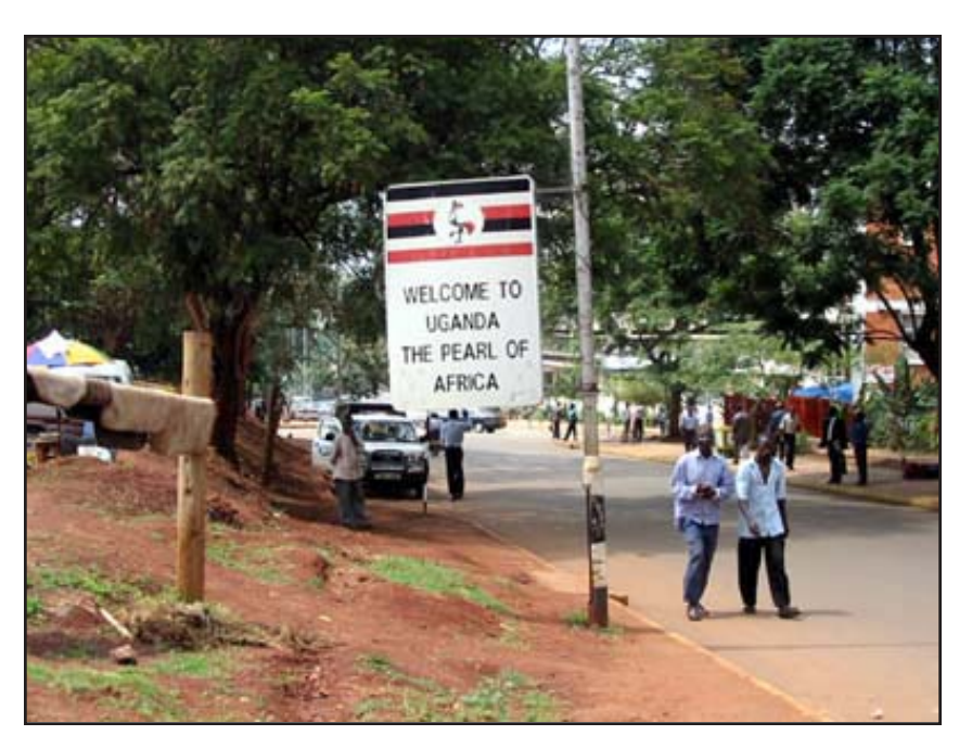
Pearl of Africa: This is a sign on Kimathi Ave. in Kampala. Winston Churchill came to visit Uganda for a couple of weeks in 1907, shot a prodigious number of animals, and dubbed the country "the pearl of Africa." (He also suggested that Kampala was unfit for habitation: "there seems to be a solemn veto placed upon the white man's permanent residence in these beautiful abodes.") The nickname stuck.

Granted, America was overwhelming at first. In Uganda, school children are discouraged from talking in class—it is taken as a sign of disrespect to the lecturer. At Indiana students talked all the time. "A kid can talk to