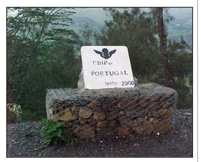
This pile of rocks was stacked with the assistance of Portugal.

And scurrying about the margins of the whole show are all of the UN agencies — UNDP, UNHCR, UNICEF, UNOPS, UNIFEM, etc — and 100 or so International Non-Governmental Organizations (INGOs) bringing in funds