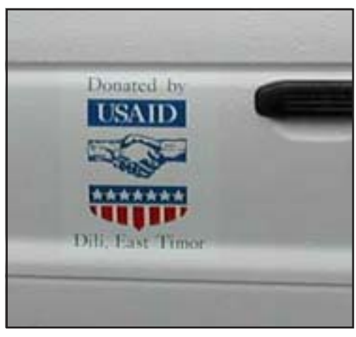
USAID wants the world to know who donated this truck.

There are similar threads in many of the stories, and nearly every story has a current parallel here in East Timor. Aid agencies enter a small country with enormous amounts of money by local standards, and thus wield enormous power over local affairs. Local groups and individuals are strongly influenced by the chance to catch some of the incoming funds. This results in local organizations tailoring their plans to the goals of the aid agency,