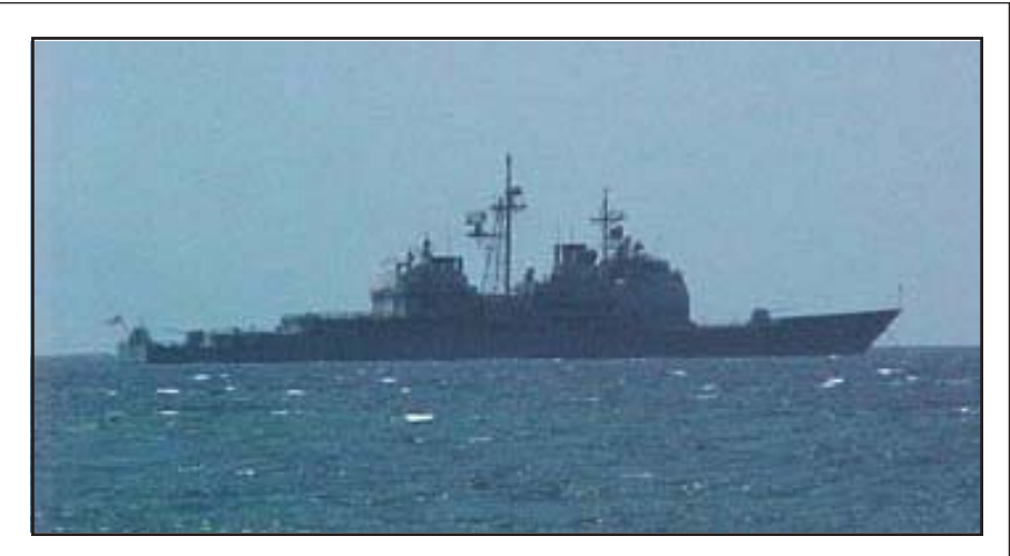
From this US warship, strangely enough, will come assistance for some community in East Timor.