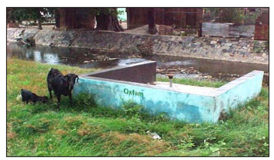
Oxfam apparently put up the water hydrant behind those two goats, though it is not working now.

and maintain their operation (i.e. jobs). Publicity is the mechanism for making this happen.