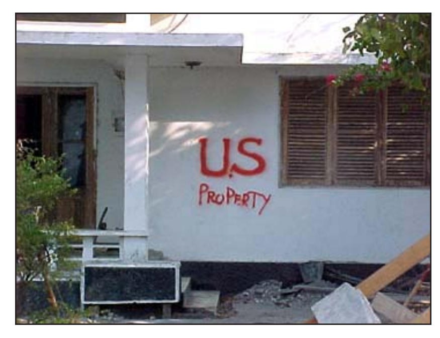
Any questions? The future site of the US Ambassador's residence in Dili.

It is an enormous challenge to get all the required elements in place for an effective aid program, but when they are, aid can help to reverse the last 500 years or so of mounting inequality. The US can and should reverse its self-serving stinginess in the area of aid and step up to this challenge. At the very least, US aid to East Timor should be seen as reparations and increased accordingly.