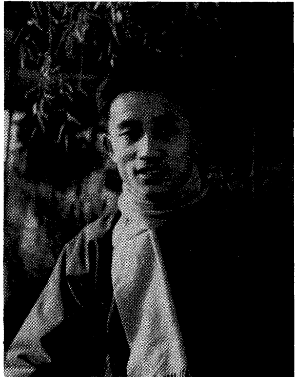
My eldest brother, a student of Fudan University, was killed during the Cultural Revolution.