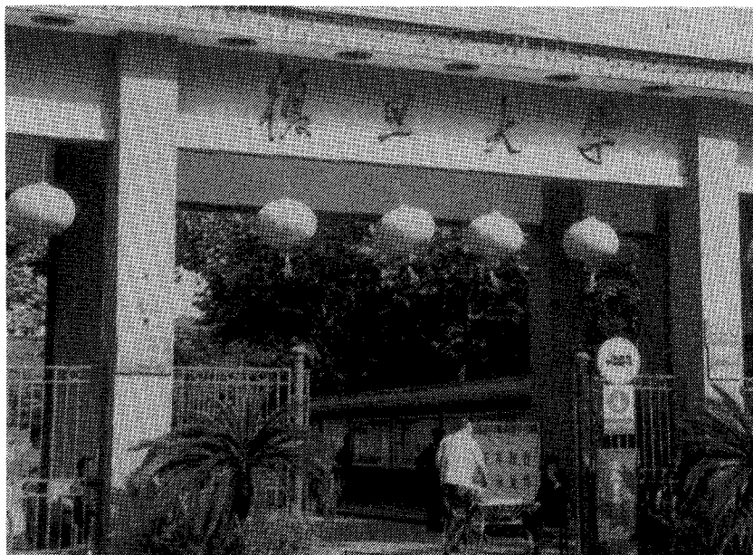
Fudan University – where my brother was persecuted 26 years ago and where now I have returned as a Visiting Professor.

No one will be persecuted, or criticized, for just listening to the “Voice of America,” even though some foreign radio stations did help agitate the Chinese political protest against the government during the 1989 Tiananmen turmoil. Today, communication and exchange with the outside world have become part of daily life in China. For my family and myself, nothing is more dramatic than the fact that I return to Shanghai as a Visiting Professor at both the Shanghai Institute of International Affairs