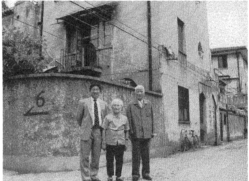
Reuniting with my parents in front of our house in Shanghai.

liberalization in political system are the broad directions that China is moving towards, but the priority, timing, leadership, public consensus, role of the military, consolidation of the legal system, and international environment are all important factors in determining the future of the country. Market mechanism has not only brought about the rapid economic development, but also led to serious problems such as corruption, inflation, and polarization. The Chinese Communist Party has undoubtedly been losing its authority and power. But if this process happens too fast, the country will be in chaos. I am not sure that the American media has ever yet given adequate emphasis to the complexity of China's reform and the moral dilemmas involved.