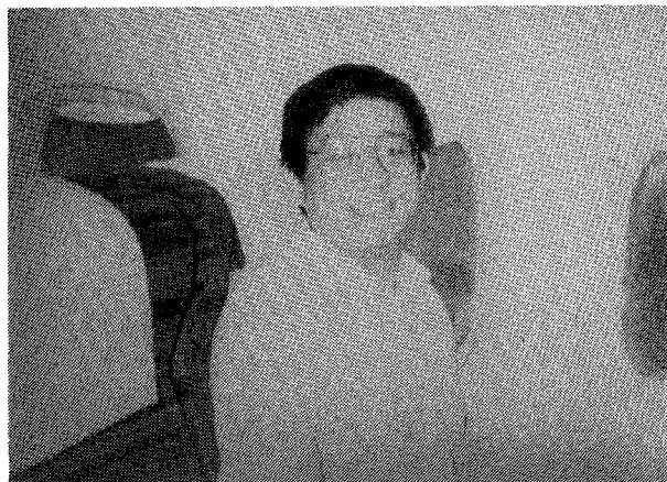
On a Northwest flight from San Francisco to Shanghai.

At the end of the summer, my father was forced to leave us and was sent to a remote and isolated place. I was not able to go to school for three years, because if I