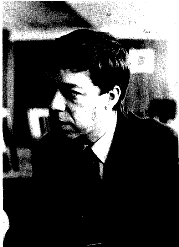
Rudolf Bauer, Mayor of Kosice

The most controversial of Bauer's positions is his support of strong regional government, since it runs contrary to the Slovak parliament's own administrative scheme. The "historic" map that Bauer supports would give regional government to two districts in southern Slovakia -- Dunajska Streda and Komarno -- that run from east to west along Slovakia's border with Hungary. They would continue to consist almost entirely of Hungarian-Slovaks. The Slovak government's plan, by comparison, would divide Slovakia into seven districts that would run from north to south. The