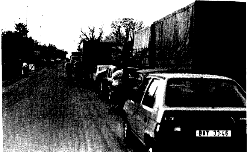
On the Slovak-Ukrainian border

But Bauer argues that it is in the interests of the Slovak people to decentralize the government, since democratically-elected regional administrations are less likely to provoke their neighbors across state borders. "I am sure that the second level of regional government should be created that wouldn't be so dependent on the government because they would be elected from below," he said. "The central government has a tendency to destabilize."